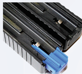
3D printed, MCD/slide cover plate comparison (Installed)

For more information visit: https://www.atf.gov/firearms/private-made-firearms