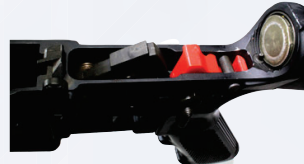
AR-type MCD installed in fire control cavity

* AR-type MCDs, even taken alone, are machineguns as defined under federal law, and the installation of AR-type MCDs into semiautomatic, AR-type firearms, depending on the weapon configuration, will convert such firearms to function as an automatic weapon.