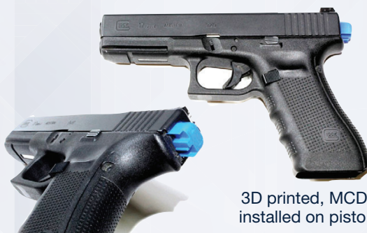
3D printed, MCD installed on pistol