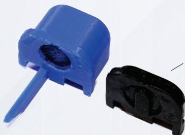
3D printed, MCD/slide cover plate comparison