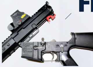
AR-type MCD on lug of upper assembly

For more information visit: https://www.atf.gov/firearms/ privately-made-firearms