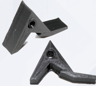
3D Printed AR-type MCDs